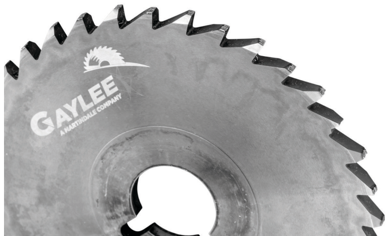
Solid carbide saw with dull, worn teeth.

High speed steel and solid carbide saws can be resharpener numerous times before needing to be re-gashed, at which time teeth can be reground. Only limitation is minimum diameter acceptable for your application.