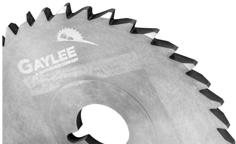
Solid carbide saw with sharpened and reconditioned teeth provides maximum cutting capability.