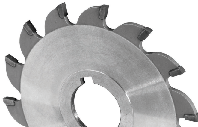
Carbide Tipped saw after retipping and reshaping in optimum condition.