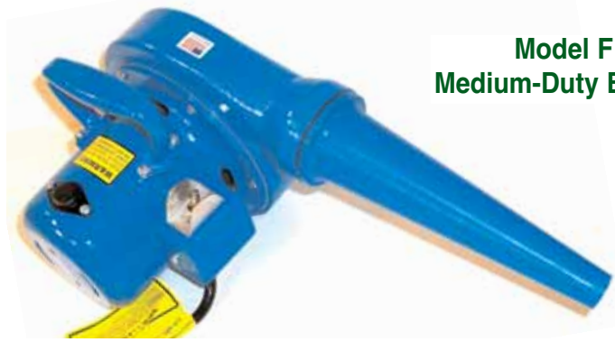
Model F Medium-Duty Blower

Model F is 2/3 h.p.; air speed 307 m.p.h.; air volume 109 cubic feet per minute; water lift 25". Equipped with 20 ft. 3-wire power cord and plug.