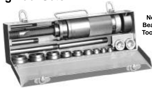
No. 2 Bearing Tool Set

The No. 1-a Bearing Tool Set above is used to insert or extract sleeve bearings of motors or other machines. Capacity is 1/2" to 1-1/16" inside diameter. Included with each set are 2 bearing supports for different motor frames and 9 taps for different diameter bushings or bearings.