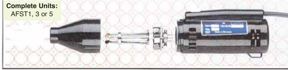
Complete Units: AFST1, 3 or 5

The drive in the Abisofix® instrument is a series wound motor of 16-42V. A transformer is required for use, and available in either 115V or 230V.