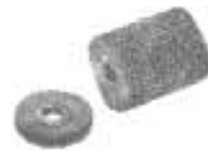
Wire Brushes for general purpose to heavy-duty wire stripping.