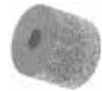
Fiberglass cylindrical brushes for fine wire stripping.