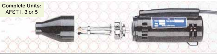
Complete Units: AFST1, 3 or 5

The drive in the Abisofix® instrument is a series wound motor of 16-42V. A transformer is required for use, and available in either 115V or 230V.