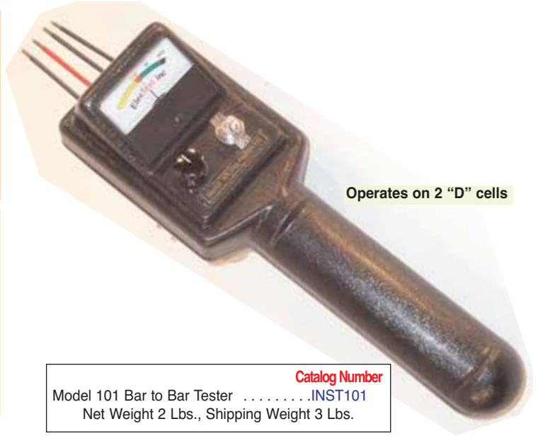
Operates on 2 "D" cells

Catalog Number Model 101 Bar to Bar Tester . . . . .INST101 Net Weight 2 Lbs., Shipping Weight 3 Lbs.