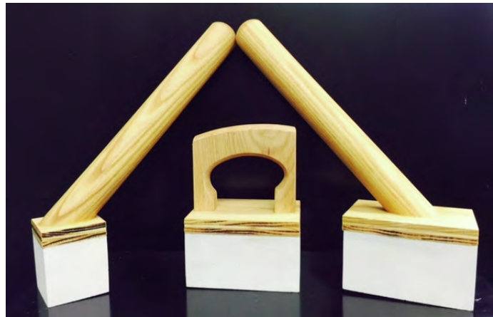
2x2x2" With Right Angle Tramway Handle

Used to seat larger brushes or clean commutators where a sturdy handle is required for safety and durability. Five grades are offered, see pg. 12 for available grades.